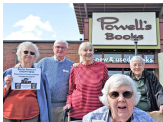
What a fun outing it was exploring Powell's Books.