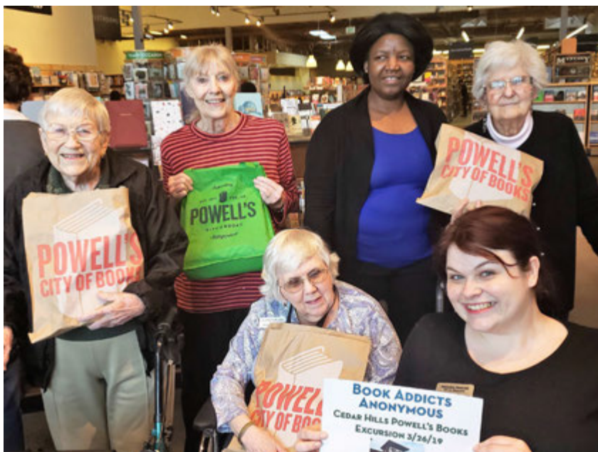
Book Addicts Anonymous pose with all their great findings from the day.