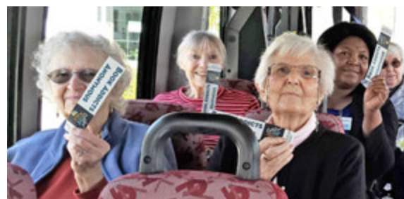
Residents are ready to go find the perfect book to read!