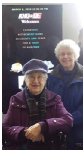
Our Out & About to KHQ Local News was very fun!

In the community and at different places around town, residents enjoyed the last few days of winter. But with May, aMAYzing times will come. Make sure you join us for our new adventures!