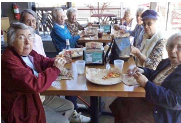
Lunch at MOD Pizza was yummy!