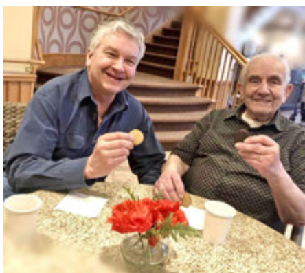
Oreo cookies were enjoyed for National Oreo Cookie Day!