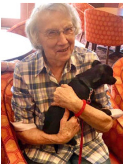
We cuddled some puppies for National Puppy Day!